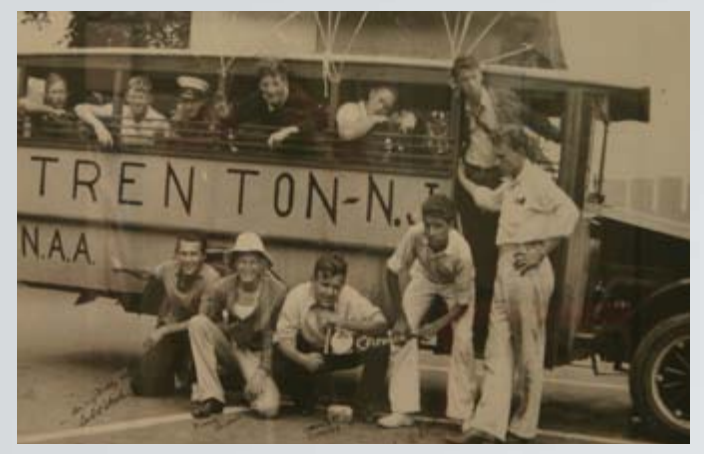
Trenton NJ, Senior NAA bus in route to 1938 Nats, the same year the AMA took over responsibility for the event.

officially recognized and these fliers were encouraged to participate in forming national rules.